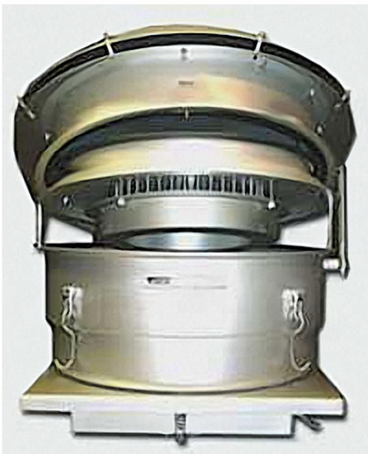
Model : 6070-2.5